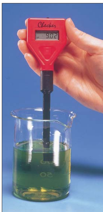
PJ820-75 in use