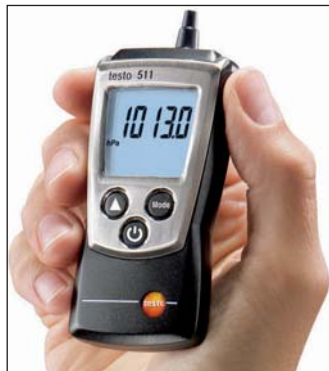
PW210-45 in use