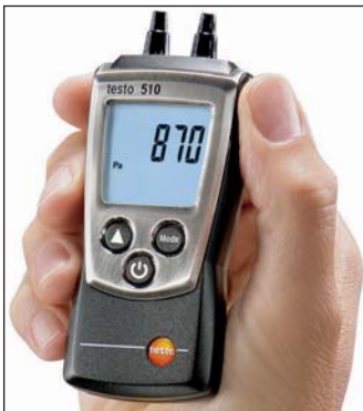
PW210-35 in use