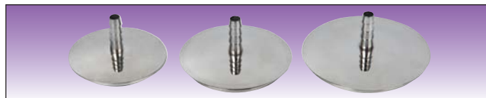
FC336-25 to -33