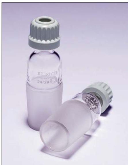
QST51, QST52, QST53