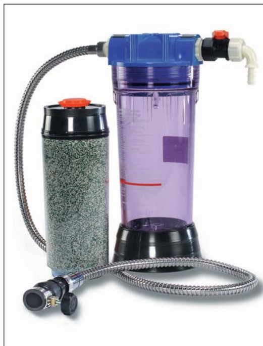
WL160 with WL164